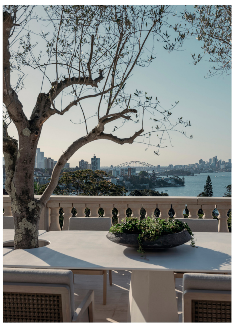
On the pool terrace, custom marble table by Nina Maya Interiors; outdoor dining chairs from Restoration Hardware; greenery and plante r from Relik Designs.