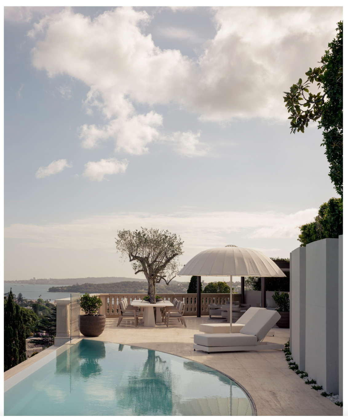
On the pool terrace of this Bellevue Hill home, custom pool lounges by Nina Maya Interiors and produced by Jade Customs; Paola Lenti Bistrò umbrella , enquiries to Moebel. <u>Details, tap here</u>.