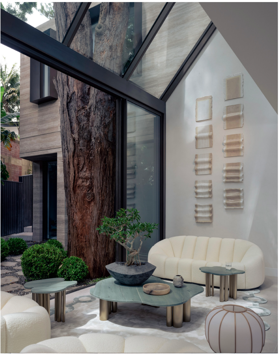
In another view of the conservatory, Alpha sofa and Club chairs by Pierre Paulin, enquiries to Moebel; custom coffee table, side tables and rug by Nina Maya Interiors; bonsai from Relik Designs; Michaël Verheyden bowl from Ondene; Suvira McDonald vase from The DEA Store; De Padova Bombori lamp from Boffi; Unnamed Flag Crayon Twins commissioned artwork by Ben Mazey.

Transparent and translucent materials are threaded throughout, and the glass conservatory is their ultimate expression. It may seem like madness to bring a glass box into a subtropical climate, but here the natural landscape lends itself to the task. "There are huge, 300-year-old trees above it that are 60 metres high — an incredible, green canopy," Maya says. "So it's not hot — it's actually like being in a rainforest; it's really protected from the sun." Though a conservatory can conjure thoughts of basic British extensions, Maya is quick to clarify. "It's a double storey void in glass and bronze metalwork," she says. "We put my favourite pieces of furniture in there, which is the Pierre Paulin setting. There's a beautiful bonsai and you feel like you could be in a different country in that part of the house, it's such a retreat."